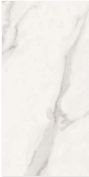
03SAL031224 (unpolished) 03SAL031224PO (polished)