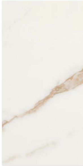
03SAL021224 (unpolished) 03SAL021224PO (polished)