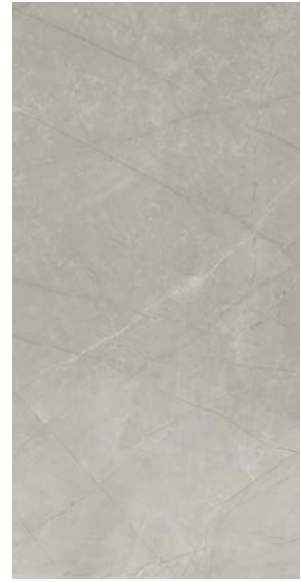
03SAL041224 (unpolished) 03SAL041224PO (polished)