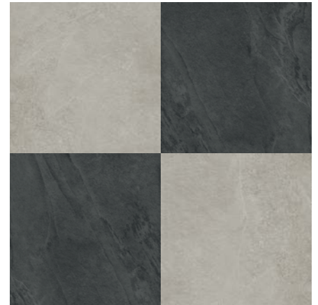
15HERSIL12 / 15HERCOA12