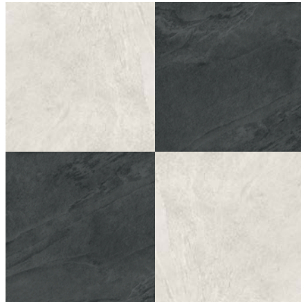
15HERSNO12 / 15HERCOA12