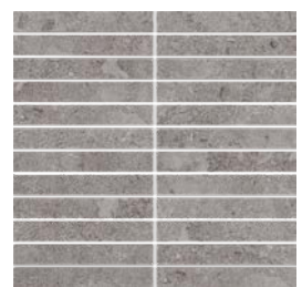
Stripe Mosaic (natural or pol.)