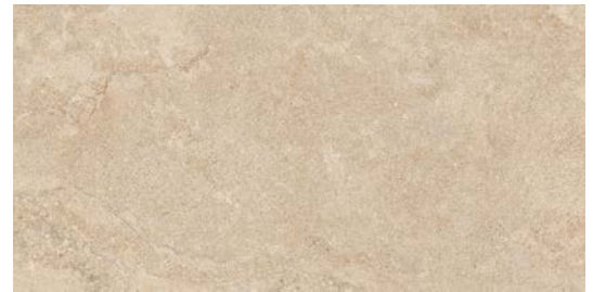
45NORSAN1224 (natural) 45NORSAN1224P (polished)