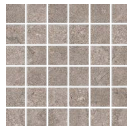
2x2 Mosaic (natural or pol.)