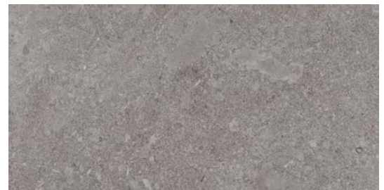
45NORASH1224 (natural) 45NORASH1224P (polished)