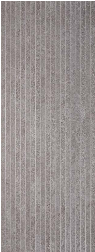
18x48 Doghe Wall Decor (Matte)