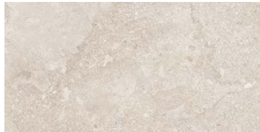
45NORIVO1224 (natural) 45NORIVO1224P (polished)