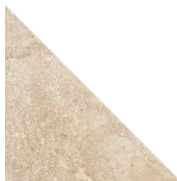
Triangle (natural or pol.)