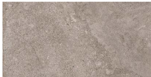
45NORFEN1224 (natural) 45NORFEN122P (polished)