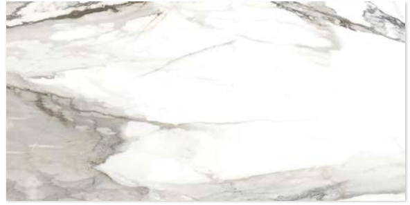
75CLAGRI1224 (matte) 75CLAGRI1224P (polished)