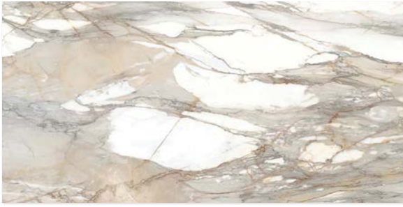
75CLACRE1224 (matte) 75CLACRE1224P (polished)