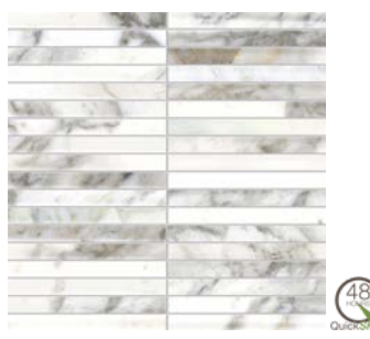
Crisp Stacked Mosaic