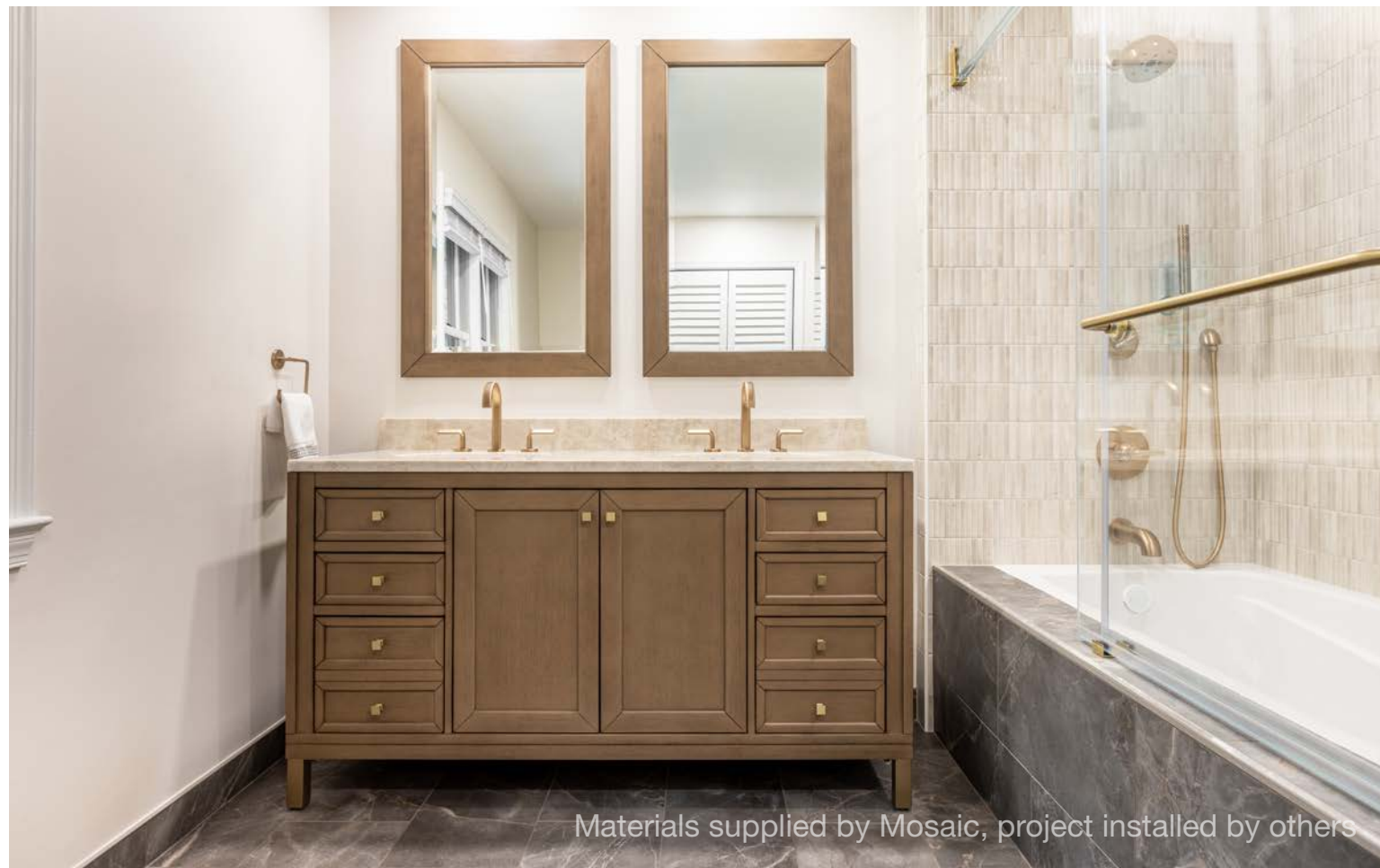
Materials supplied by Mosaic, project installed by others