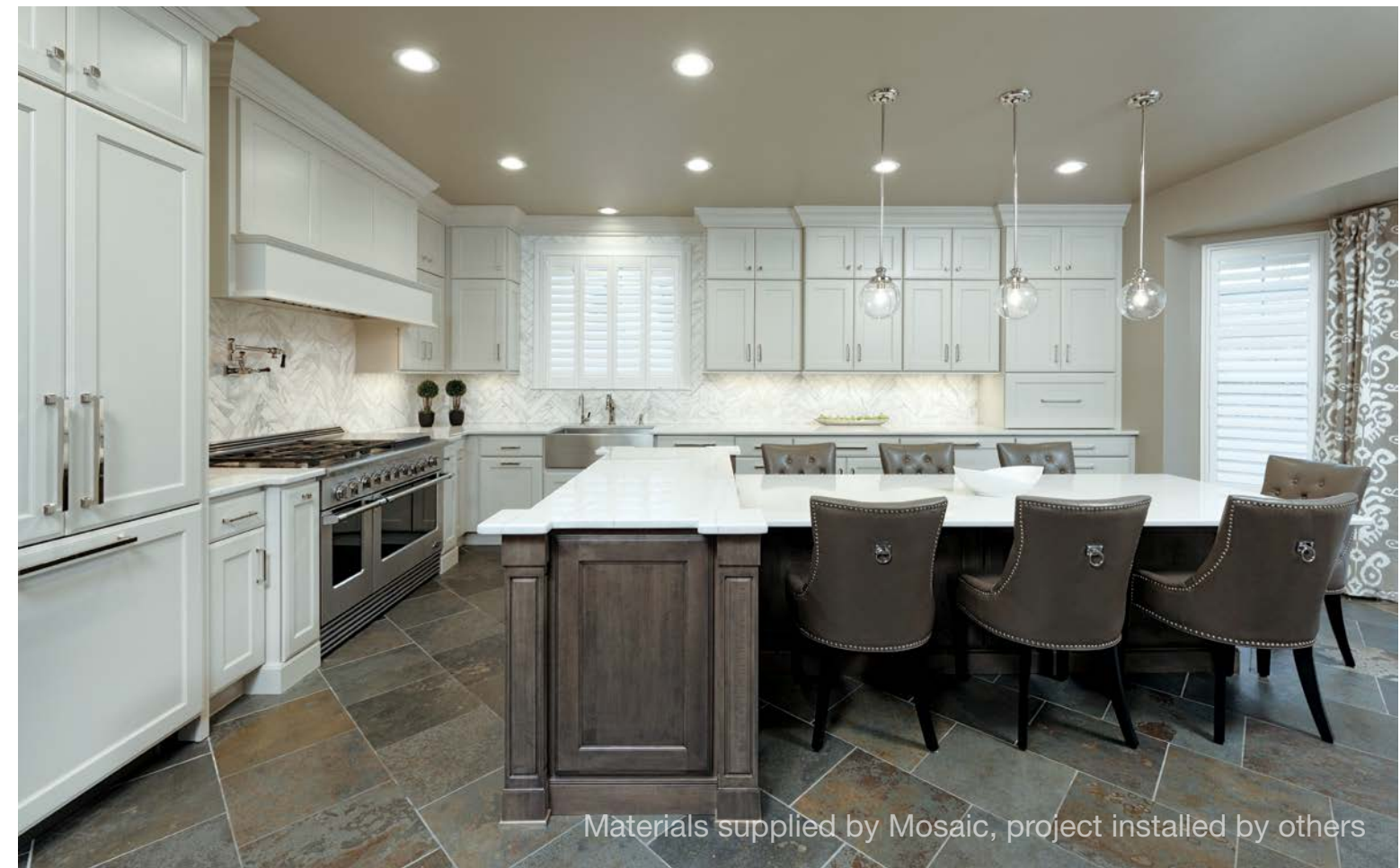
Materials supplied by Mosaic, project installed by others