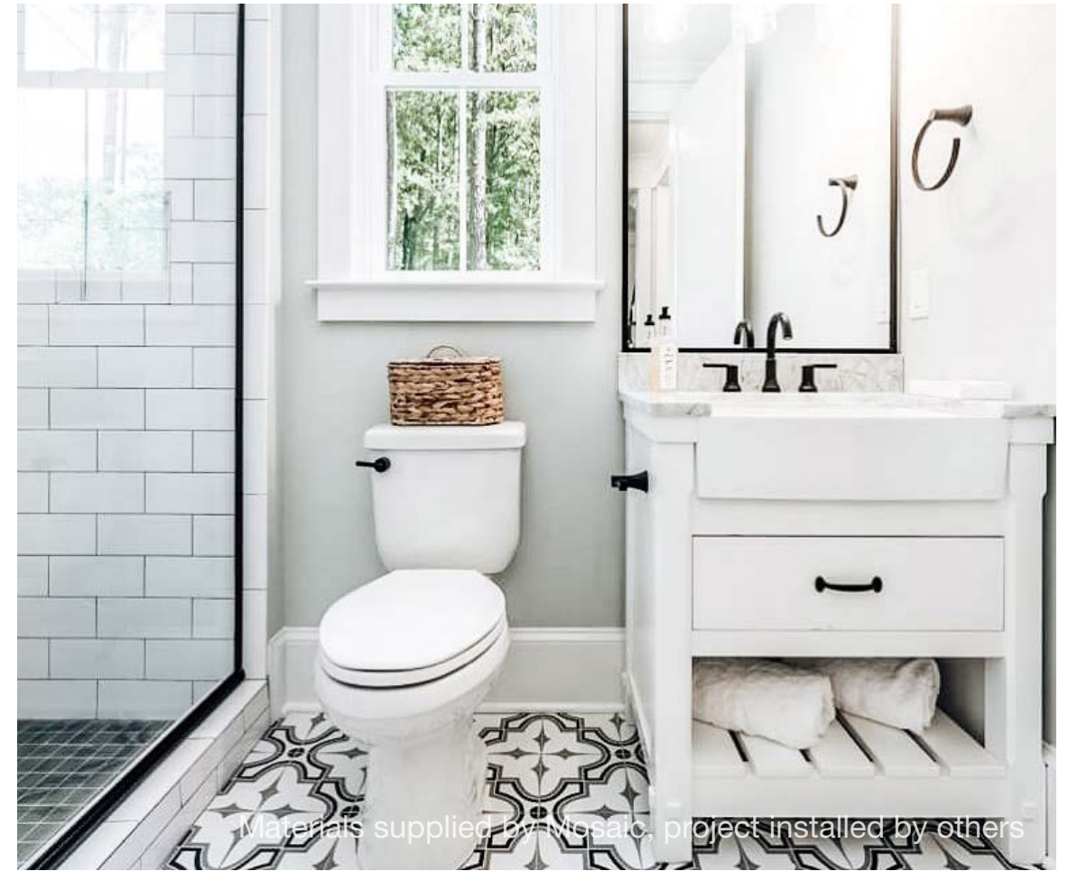
Materials supplied by Mosaic, project installed by others