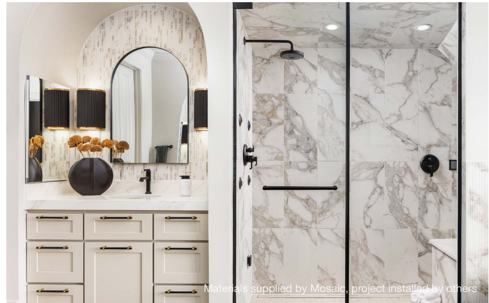
Materials supplied by Mosaic, project installed by others