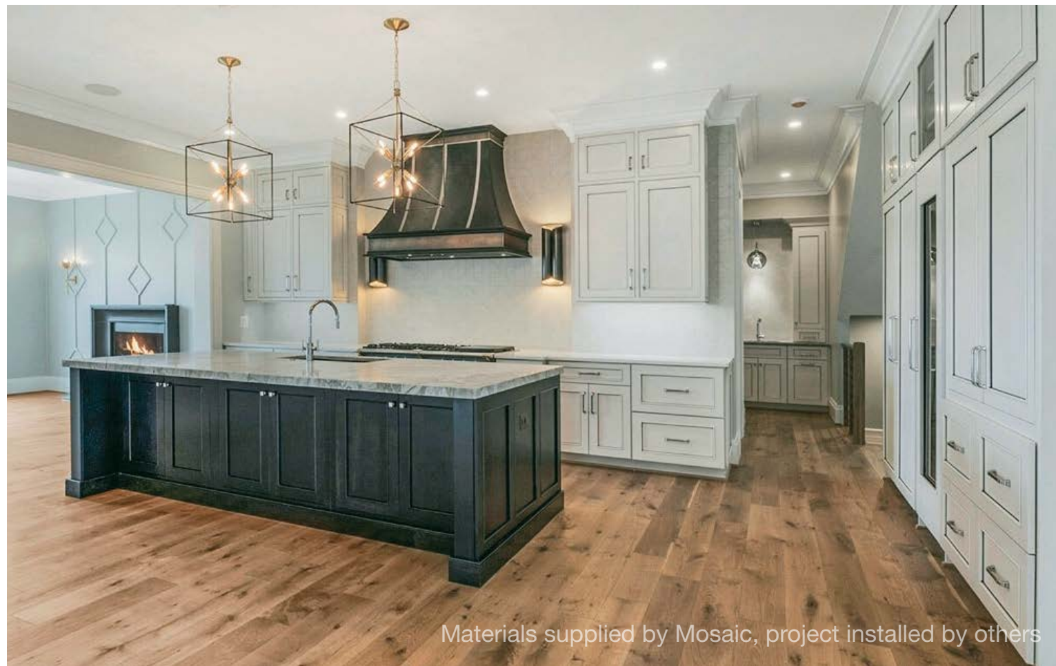
Materials supplied by Mosaic, project installed by others