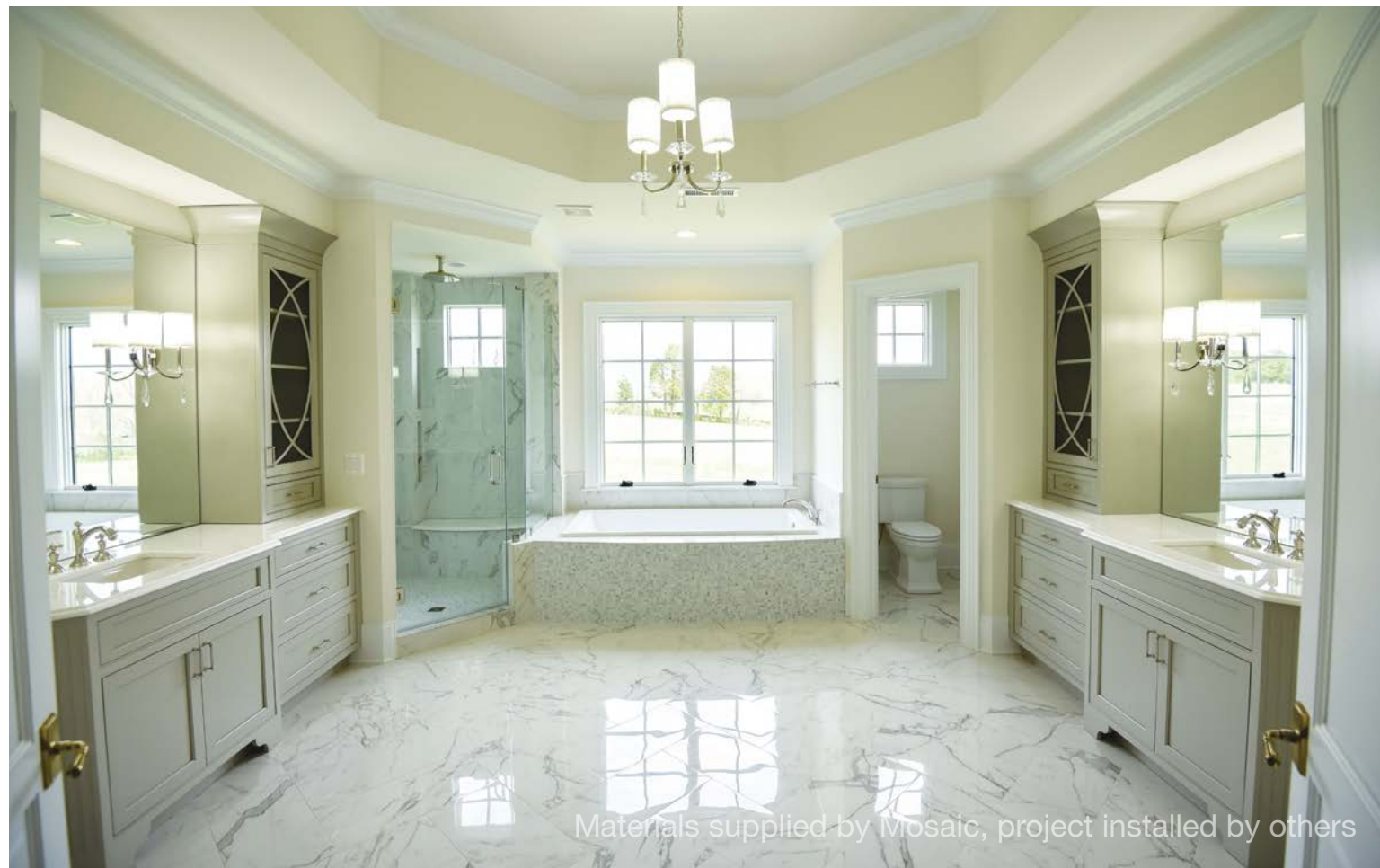
Materials supplied by Mosaic, project installed by others