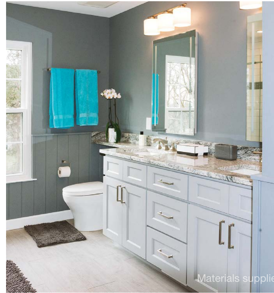
Materials supplied by Mosaic, project installed by others