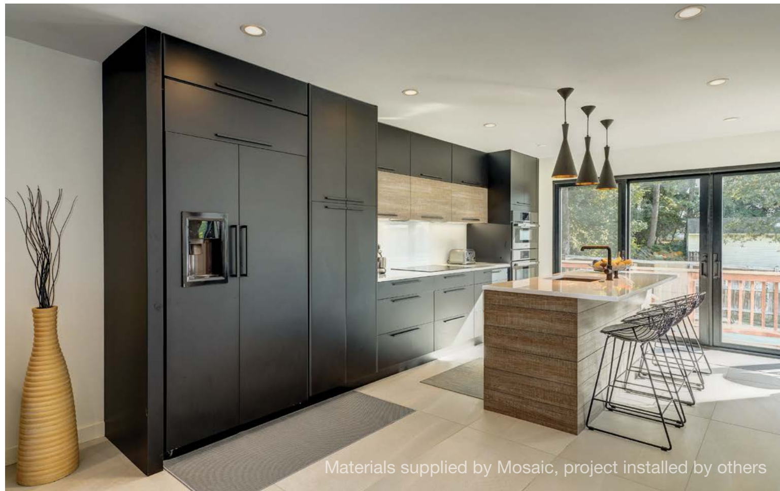
Materials supplied by Mosaic, project installed by others