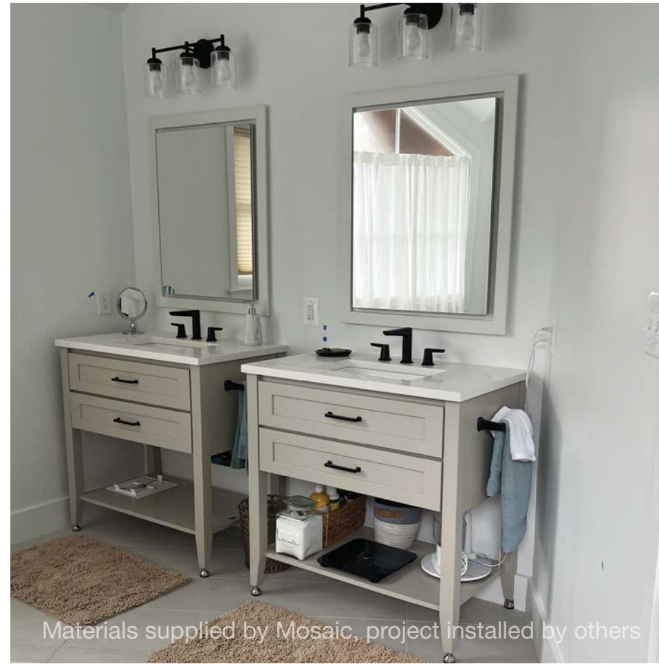
Materials supplied by Mosaic, project installed by others