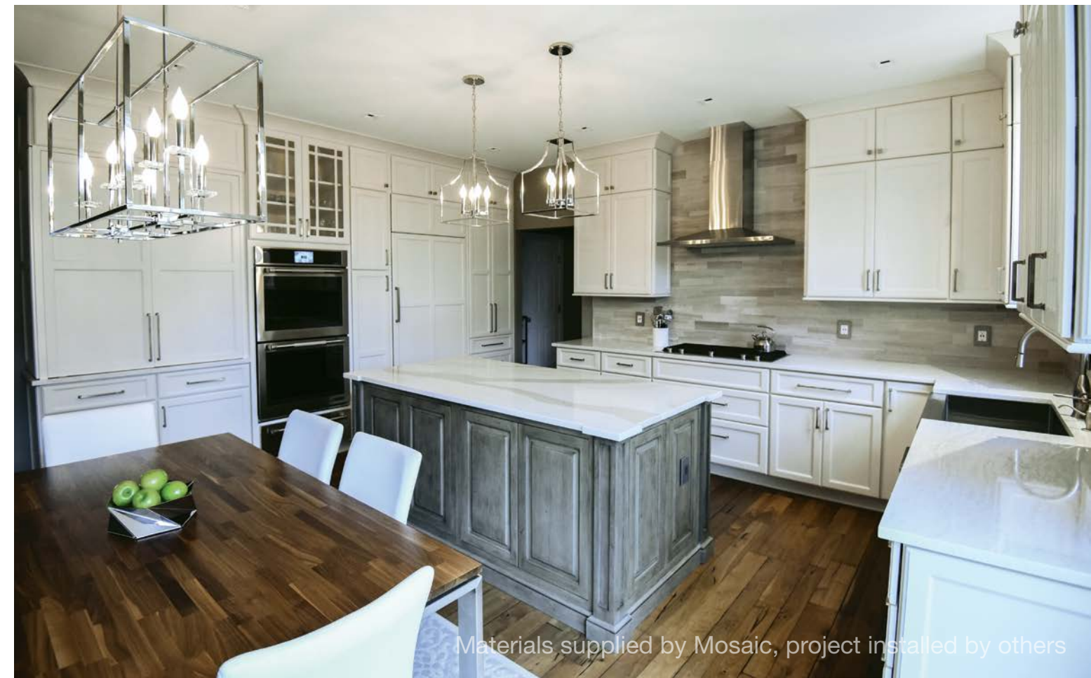
Materials supplied by Mosaic, project installed by others