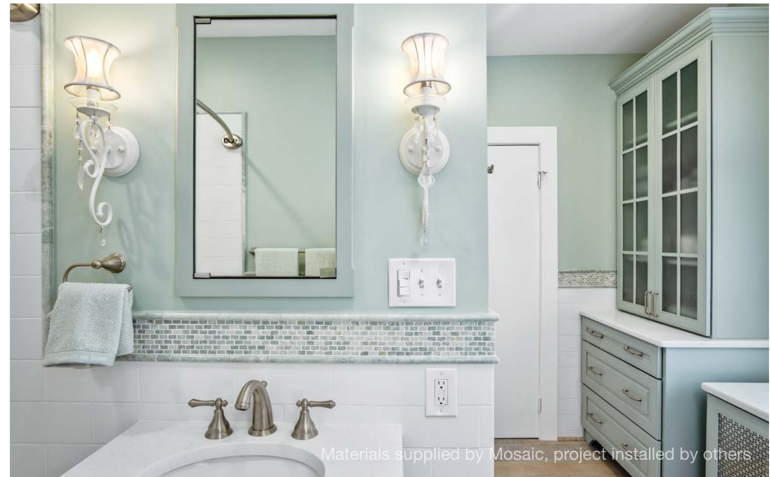
Materials supplied by Mosaic, project installed by others