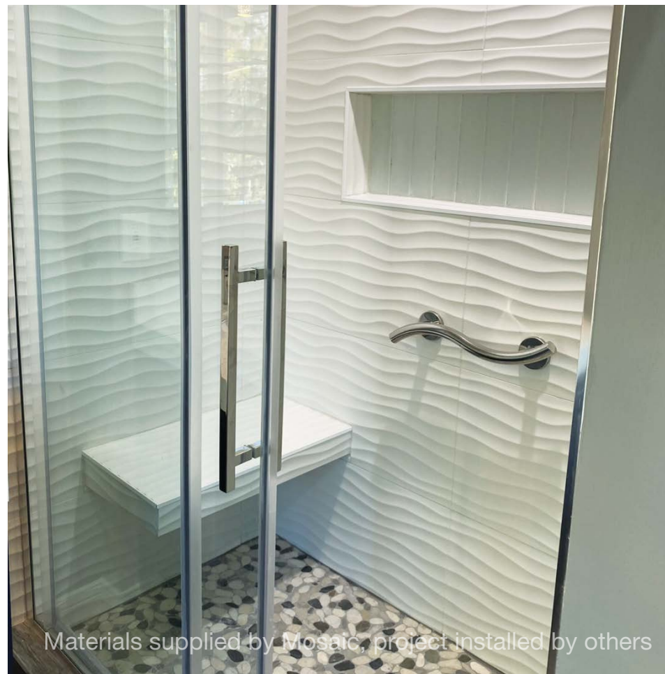
Materials supplied by Mosaic, project installed by others