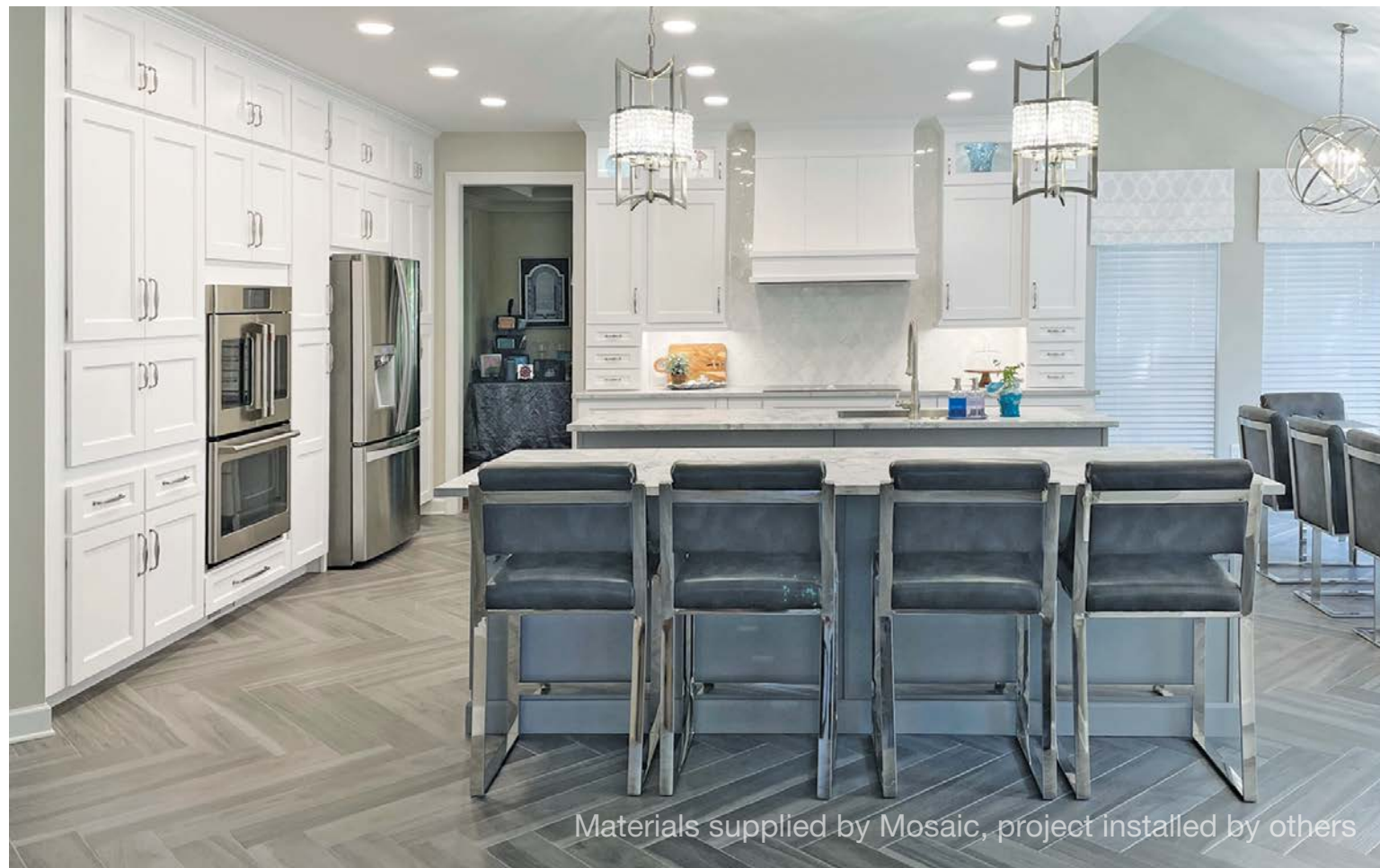
Materials supplied by Mosaic, project installed by others