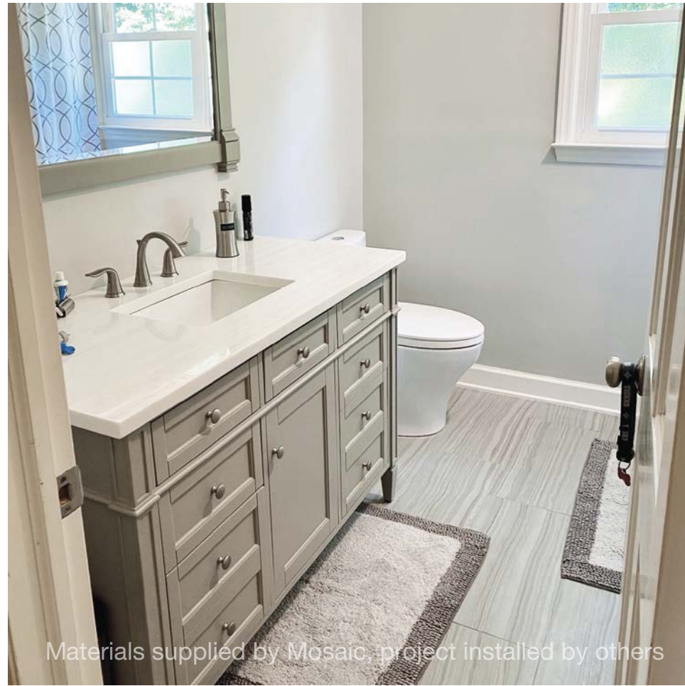
Materials supplied by Mosaic, project installed by others