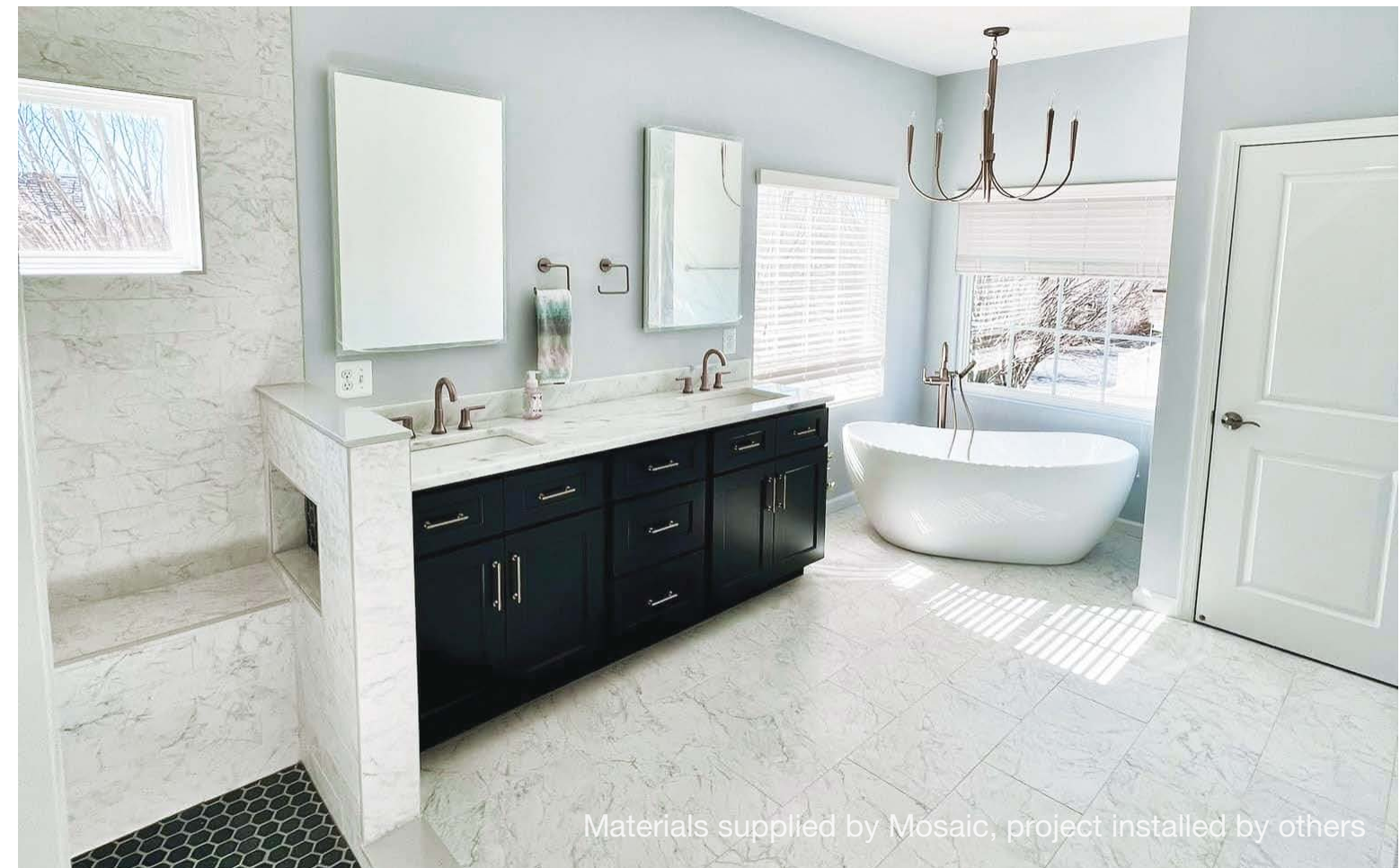
Materials supplied by Mosaic, project installed by others