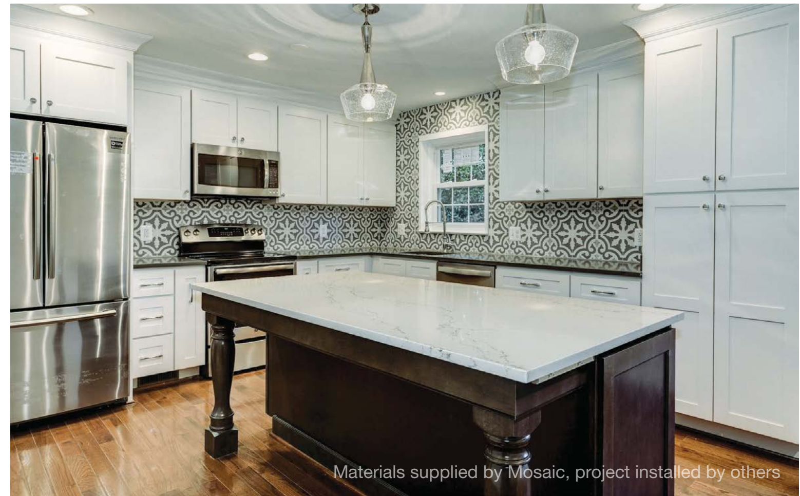
Materials supplied by Mosaic, project installed by others