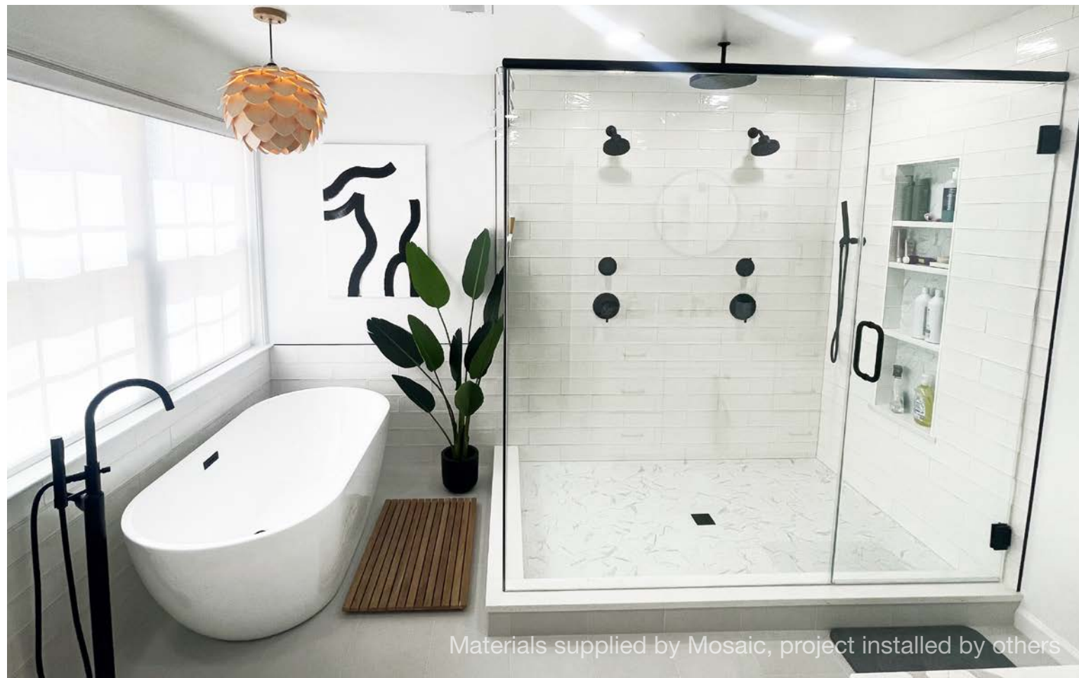
Materials supplied by Mosaic, project installed by others