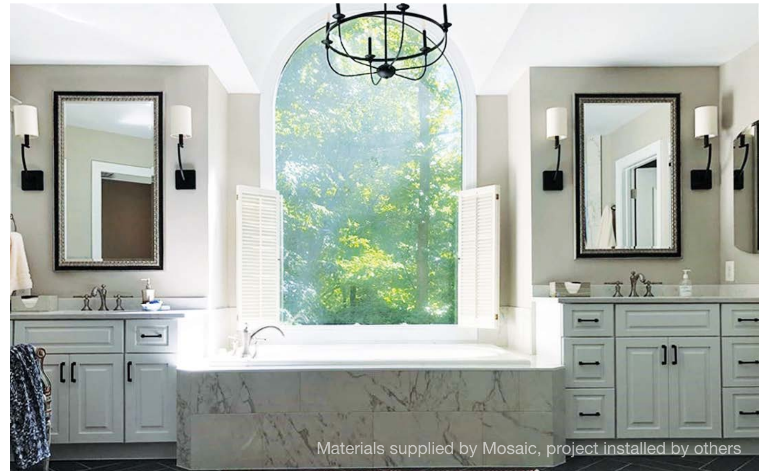
Materials supplied by Mosaic, project installed by others