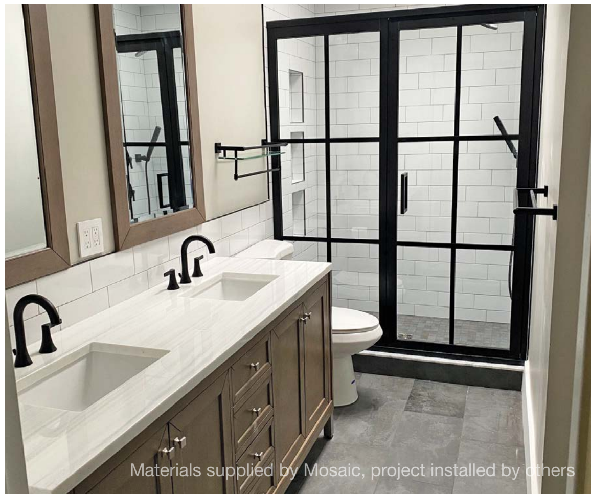
Materials supplied by Mosaic, project installed by others